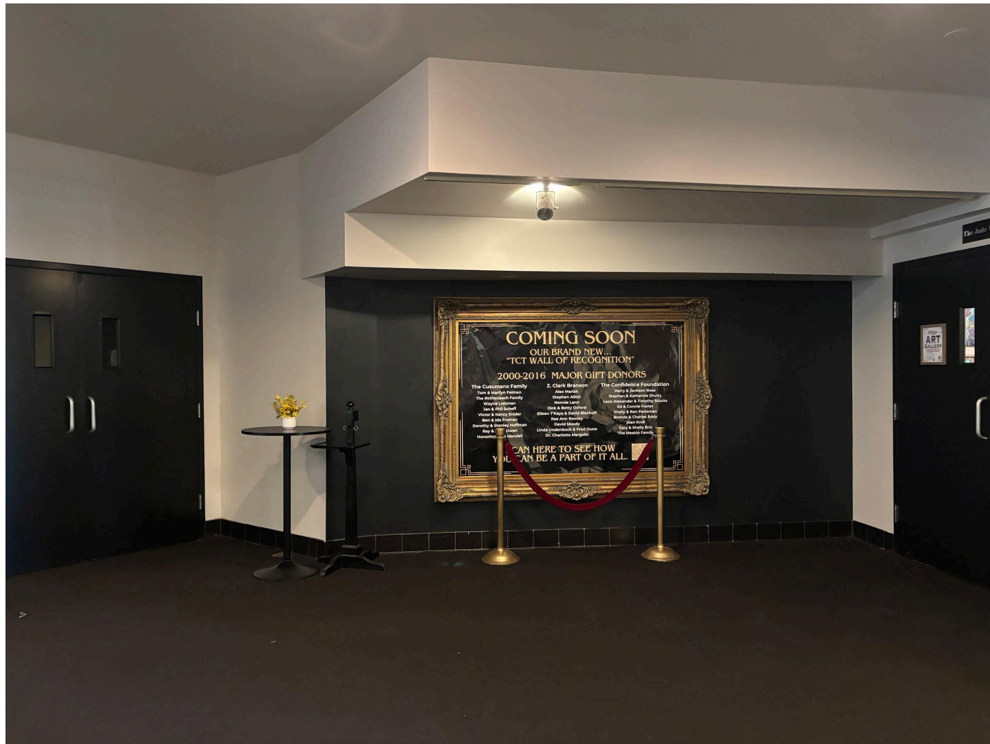
When it is time, I will walk into the theater. I may need to wait in line.