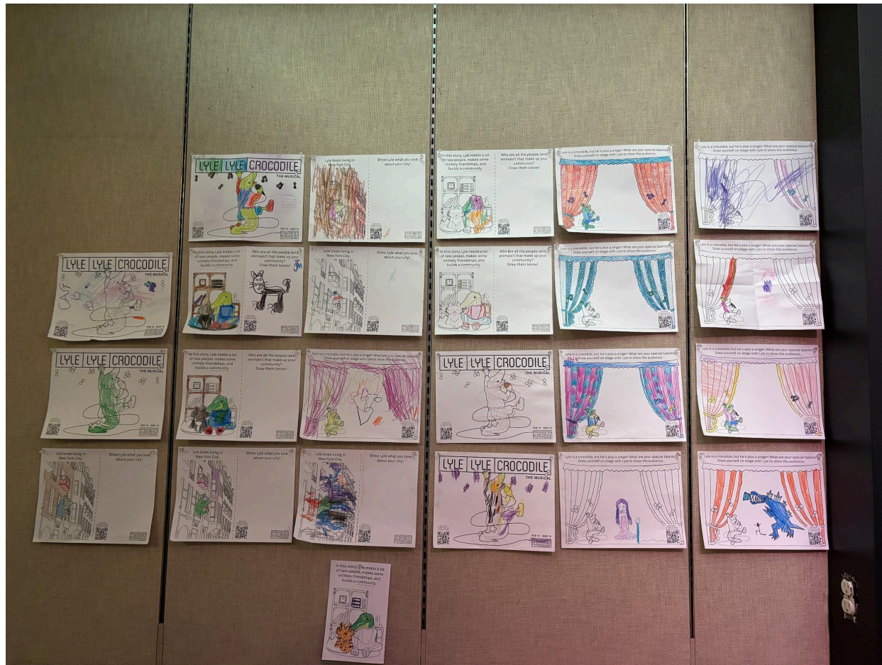
In the lobby, I can color before the show or if I need to take a break during the show.